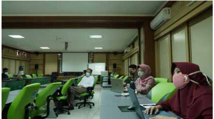
Participants consisting of Experts and SEAQIS staff are following a series of material presentation from the resource persons.